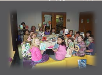
Intermediate Summer Book Club

"The Library is my favorite hangout in town! No room for stocking books and laptop on my travels, but it's all here."